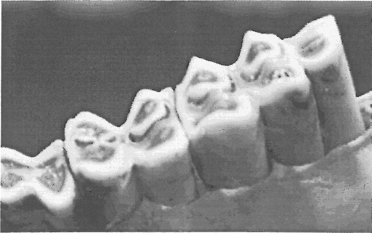
Figure 28.2: Example image, showing M1 to M3 under optimum lighting and camera alignment.