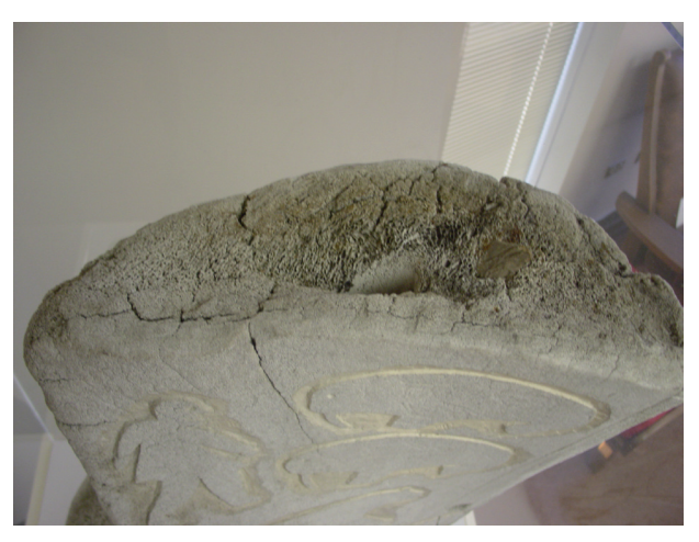
Fig. 2. Cross-section of a typical mandible.

The homogeneity of the material also presents issues for the analysis of structural elements. Considerable