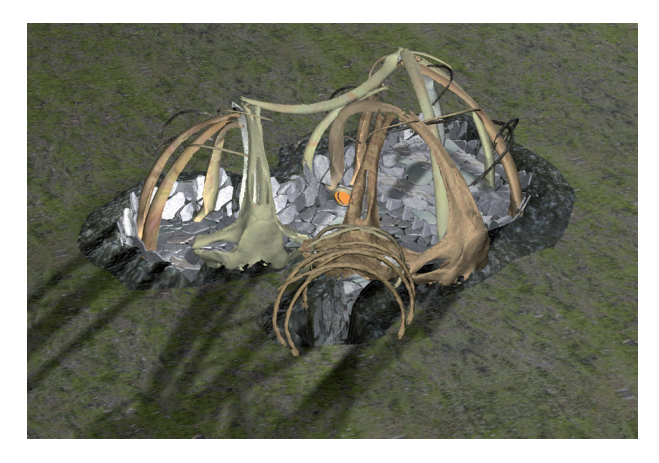
Fig. 4. Reconstruction of House 8.

nia combinations in its roof frame – one of which is placed directly over the entrance passage. The answer seems to be that symbolic uses of whalebone in Thule architecture occasionally trumped purely structural concerns.