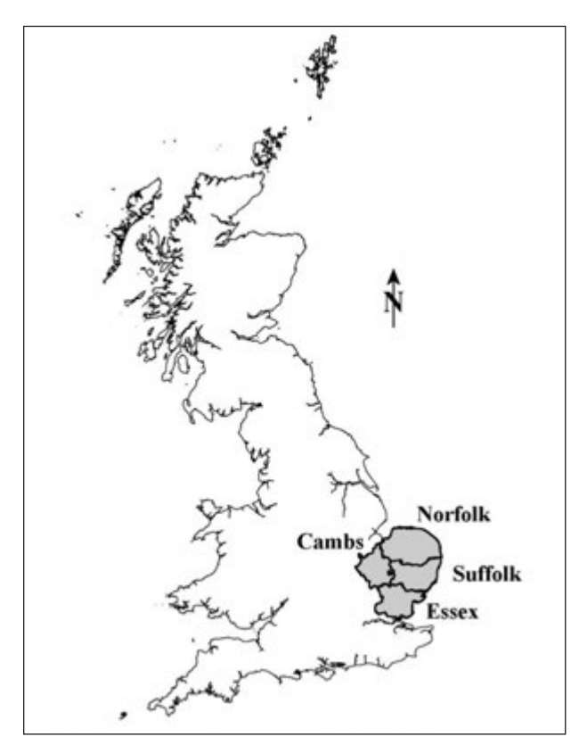
Figure 1. Map of the UK, showing the four counties of East Anglia.

CAA2011 - Revive the Past: Proceedings of the 39th Conference in Computer Applications and Quantitative Methods in Archaeology, Beijing, China, 12-16 April 2011