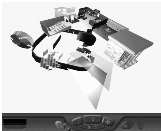
Figure 2: Layout of the spatial media and display test-bed.