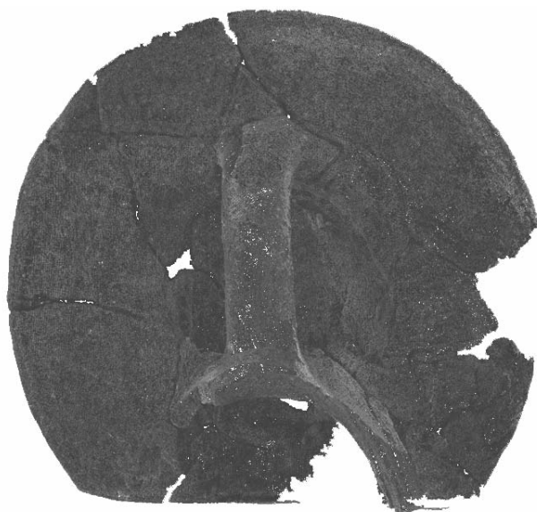
Fig. 2. The point-cloud model.

At this point, after an editing phase aimed at integrating a few small areas that hadn't been perceived by the scanner due to the morphology of the object in question, it was possible to proceed to the subsequent elaboration phases conducted on a complete three-dimensional model devoid of missing areas. The model, positioned in a Cartesian space, was intersected