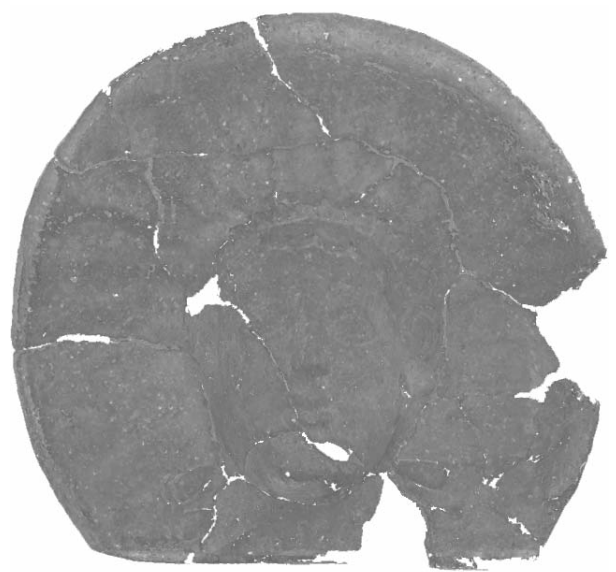
Fig. 3. Surface consisting of a polygonal mesh (single triangular faces that generate the three-dimensional object).