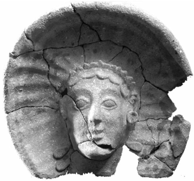
Fig. 5. Application of a pattern obtained through the photographic campaign.