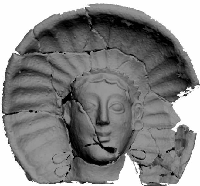
Fig. 4. Application of a generic pattern to the three-dimensional surface.

The design files, in .dwg format, are subjected to a 'nesting' procedure for the cutting material, chosen before the creation of a file suitable to the three-axis cutting machine. Next the single elements are reassembled to recompose the reproduced object in its entirety and true-to-life form. This application allows realizing elementary and non-complex plane elements. Instead the second application allows the realization of complex models, such as antefixes, by using an anthropomorphic robotic arm. The procedure consists in extracting the predefined model from a solid parallelepiped made of a chosen material (wood, polystyrene, stone or other) by means of a robotic arm on whose extremity an electric drill has been mounted, that is an electric motor that is able to support and power the rotation of a cutting utensil.