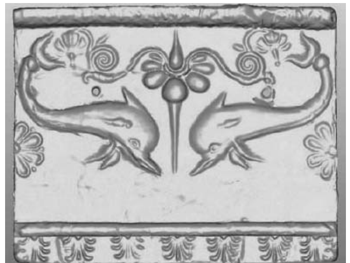
Fig. 7. Screen shot of the 3-D reconstruction.

Thus, in a first attempt the left side of the plaque was reconstructed from its fragments by manually aligning the top surface of the pieces to a plane drawn in 3-D space and adjusting their position along the z-axis to this alignment plane. This approach proved to be fairly difficult and was abandoned. Rather, other fragments from the left side that did overlap were selected, and these were ultimately used following the procedure for overlapping fragments described above. Finally, the two sections were merged to produce the three-dimensional reconstruction shown in figure 7.