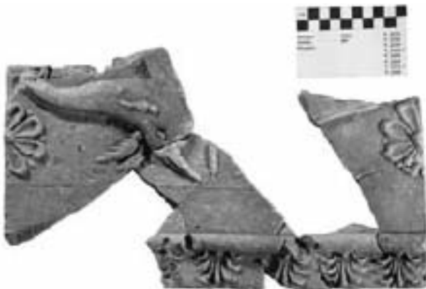
Fig. 4. Joining fragments across horizontal dimension.