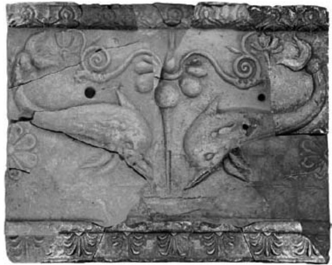
Fig. 2. Photographic reconstruction of dolphin plaque by Carrier (2002).

photographic reconstruction from over 20 pieces (figure 2). During the photographic reconstruction it became apparent that the fragments came from tiles of different sizes, since individual fragments needed to be rescaled as well as moved and rotated in order to overlap appropriately. Two sets of joins establish the overall configuration and the approximate dimensions of the object (figures 3 and 4).