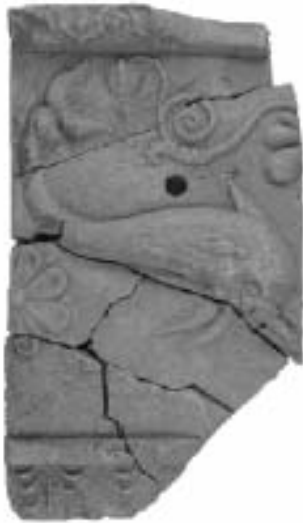
Fig. 3. Joining fragments across vertical dimension.

photographic reconstruction from over 20 pieces (figure 2). During the photographic reconstruction it became apparent that the fragments came from tiles of different sizes, since individual fragments needed to be rescaled as well as moved and rotated in order to overlap appropriately. Two sets of joins establish the overall configuration and the approximate dimensions of the object (figures 3 and 4).