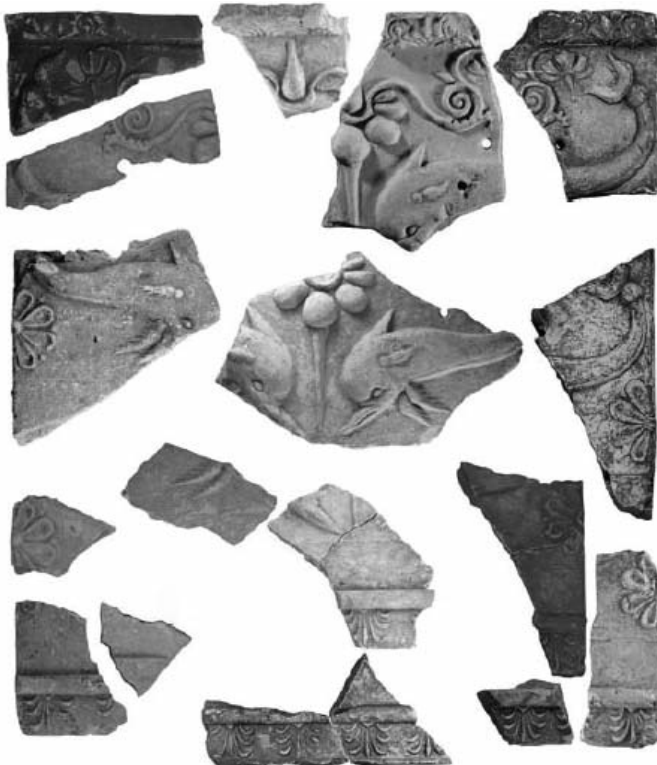
Fig. 5. Mosaic of fragments used in 3-D reconstruction.

During the summer of 2003, some 76 plaque fragments were scanned in three dimensions with a Minolta VIVID 900 digital laser-scanner. In this process objects are placed on a computerdriven rotary stage, and scans taken at regular intervals, typically in 60-degree increments. A three-dimensional point-cloud is assembled from the individual scans with commercial software (Raindrop Geomagic’s Studio). The composite point-cloud typically requires some manual cleaning-removal of outliers, portions of the rotary stage, and other scanning artifacts. Next a triangular mesh is constructed from the points. Following further editing, a best-fitting NURBUS surface is computed and displayed. The three-dimensional reconstruction of the dolphin plaque proceeded from the 3-D models of individual fragments-the fragments selected for the reconstruction are illustrated in figure 5.